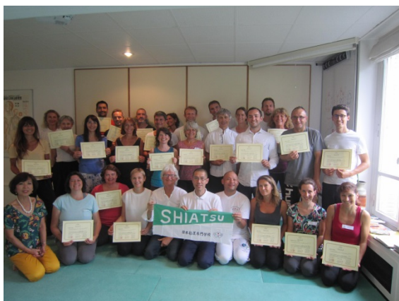
August 20, 21 Group