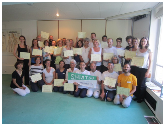
August 22, 23 Group