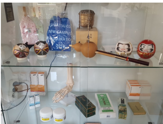
A towel & a pin badge of JSC