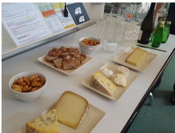
Variety of Cheese with Wine