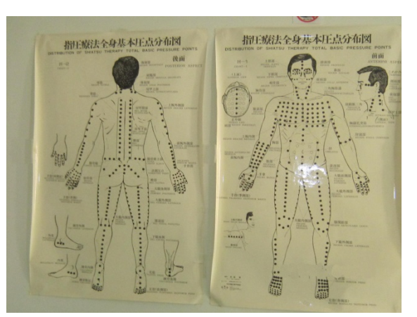
Namikoshi shiatsu points