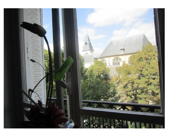
Saint-Medal church from the window